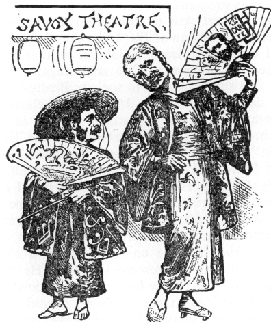
Cartoon in PUNCH, March 28, 1885.

The characters include the standard G&S principal